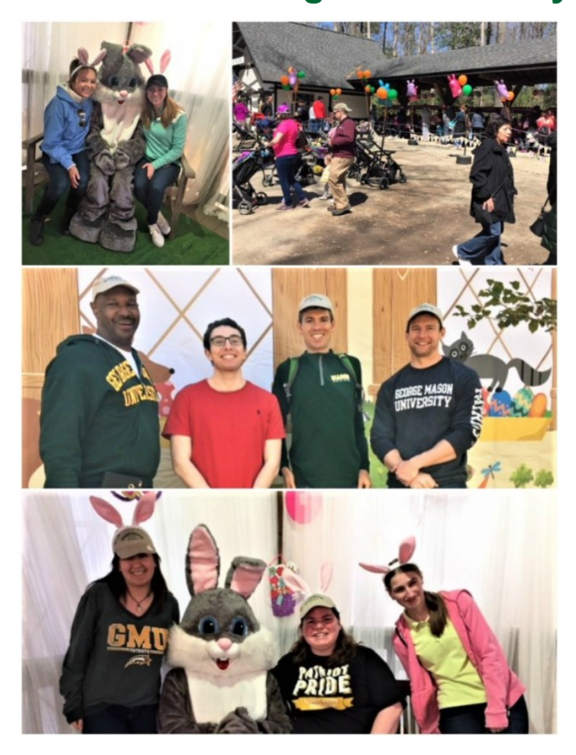
This past Saturday PRLS 210, 310 and 323 students participated in leading or assessing the 2nd Annual Egg Hunt for 1,000 participants at Burke Lake Park.