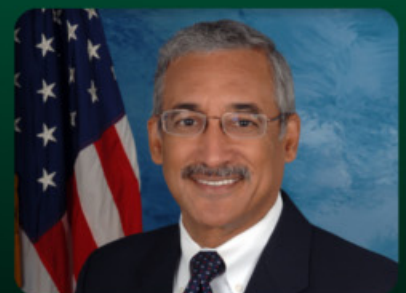
Congressman Bobby Scott (D-VA)